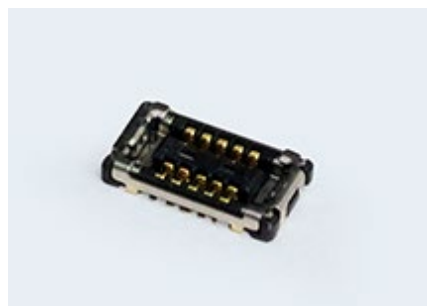
Socket : CPBE7□□-0101F