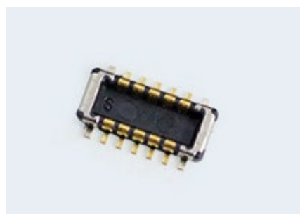
Plug : CPBE8□□-0101F