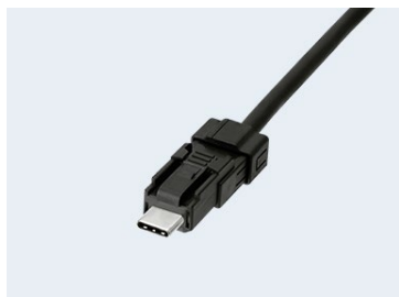
Cable Plug : CSC1024-4J□□F