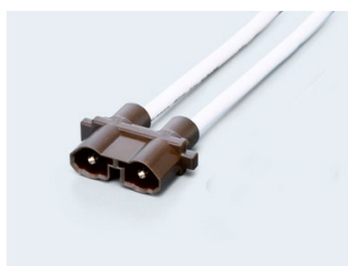
Plug : CCT9402-5801F