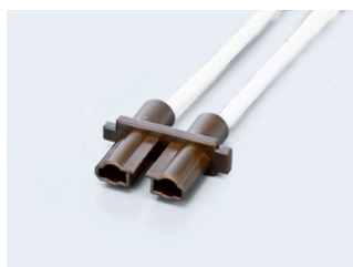
Socket : CCT9402-5901F