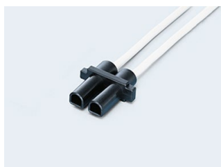
Socket : CCL0504-0101F