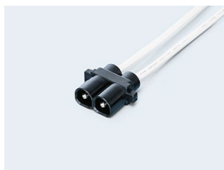
Plug : CCT0104-0101F