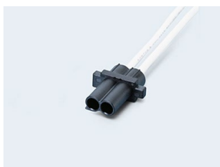
ソケット : CCL0505-0120F