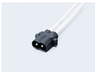
プラグ : CCL0105-0120F