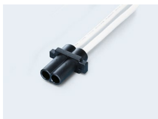
Socket : CCL0505-0100F