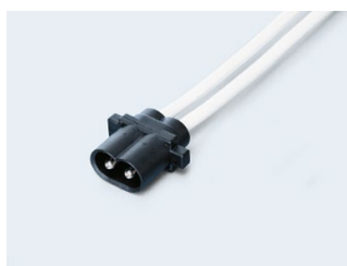
Plug : CCL0105-0100F