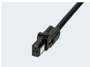
Cable Jack : CSS1002-69□□F